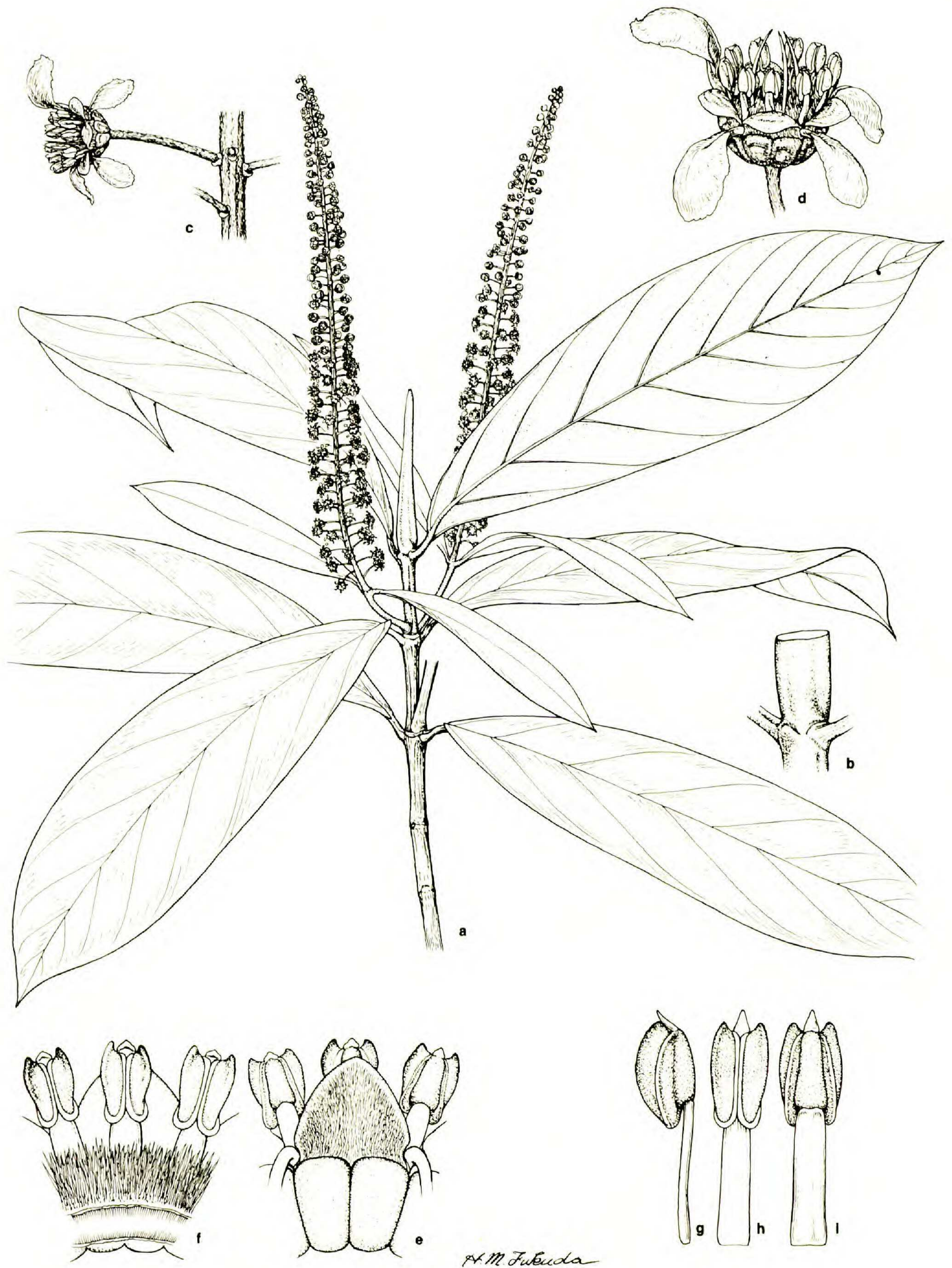
FIG. 3. Acmanthera parviflora : a, habit, \times 0.5 ; b, stipular sheath in cross-section, \times 1.5 ; c, flower, \times 2.5 ; d, flower, \times 5 ; e, sepal and stamens, dorsal view, \times 10 ; f, stamens, ventral view with ovary removed, \times 10 ; g-i, stamens in lateral (g), ventral (h), and dorsal (i) views, \times 15 . (Drawn from Fróes 25200.)